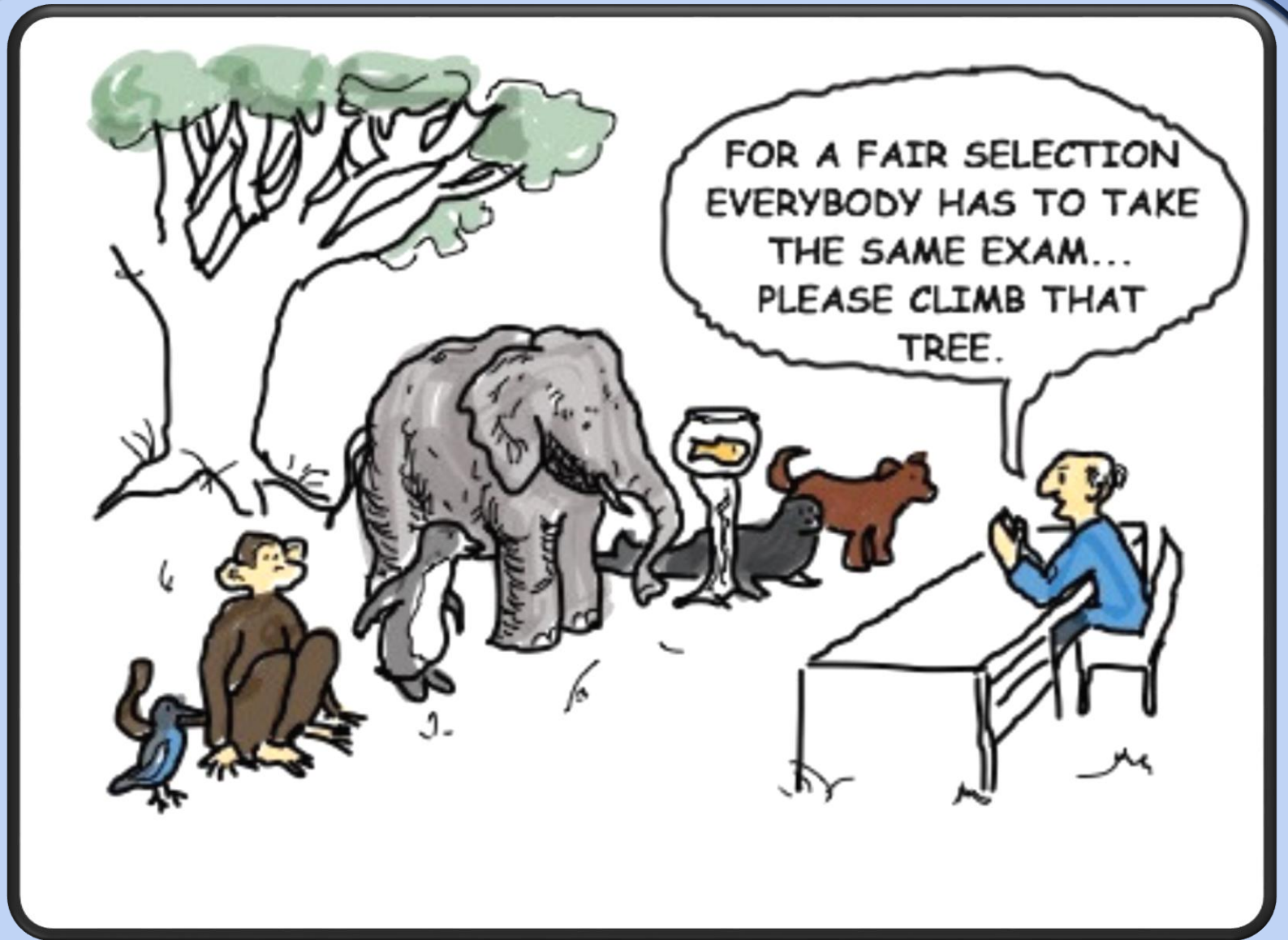
Image 3. Teaching Fish to Climb a tree?.