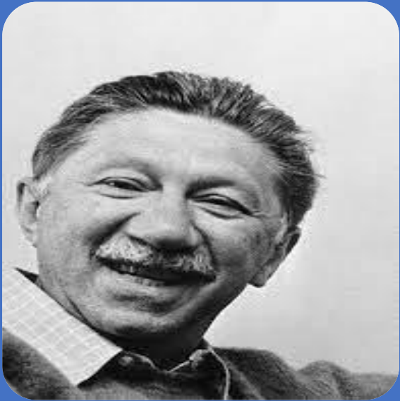
Image 1. Biography of Abraham Maslow 1908-1970. (Source: Cherry, K. 2023:Online)