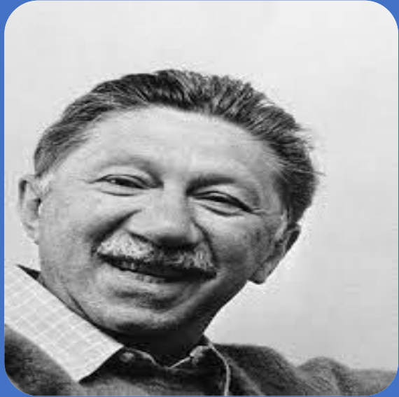
Image 1. Biography of Abraham Maslow 1908-1970.