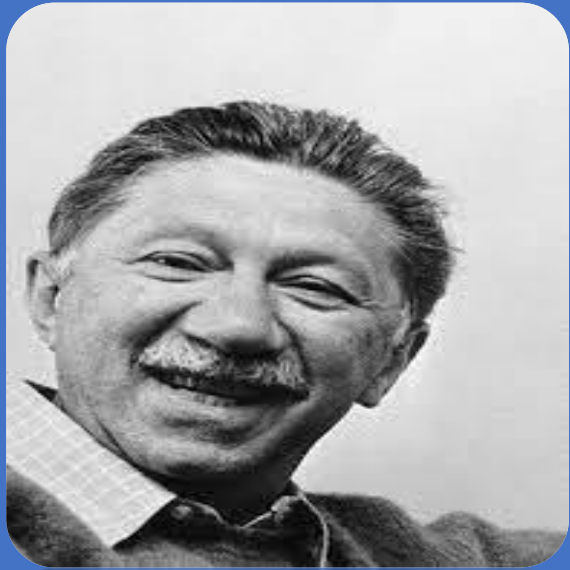
Image 1. Biography of Abraham Maslow 1908-1970.