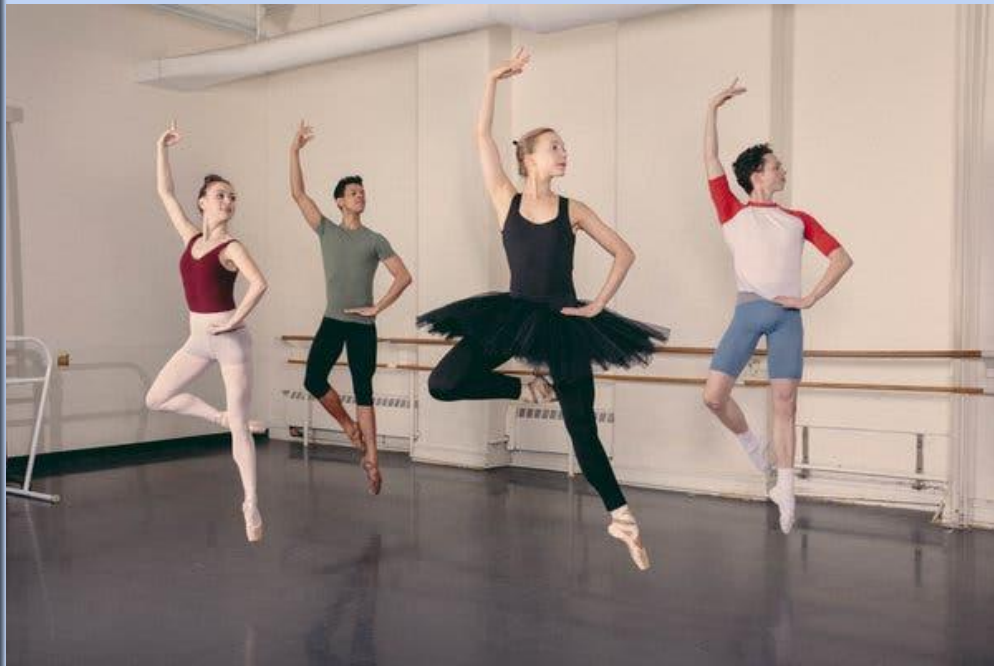
Image 2. The Place to Challenge Ballet's Gender Stereotypes? In Daily Class

Repetitions of activities allow knowledge and skills to be learned