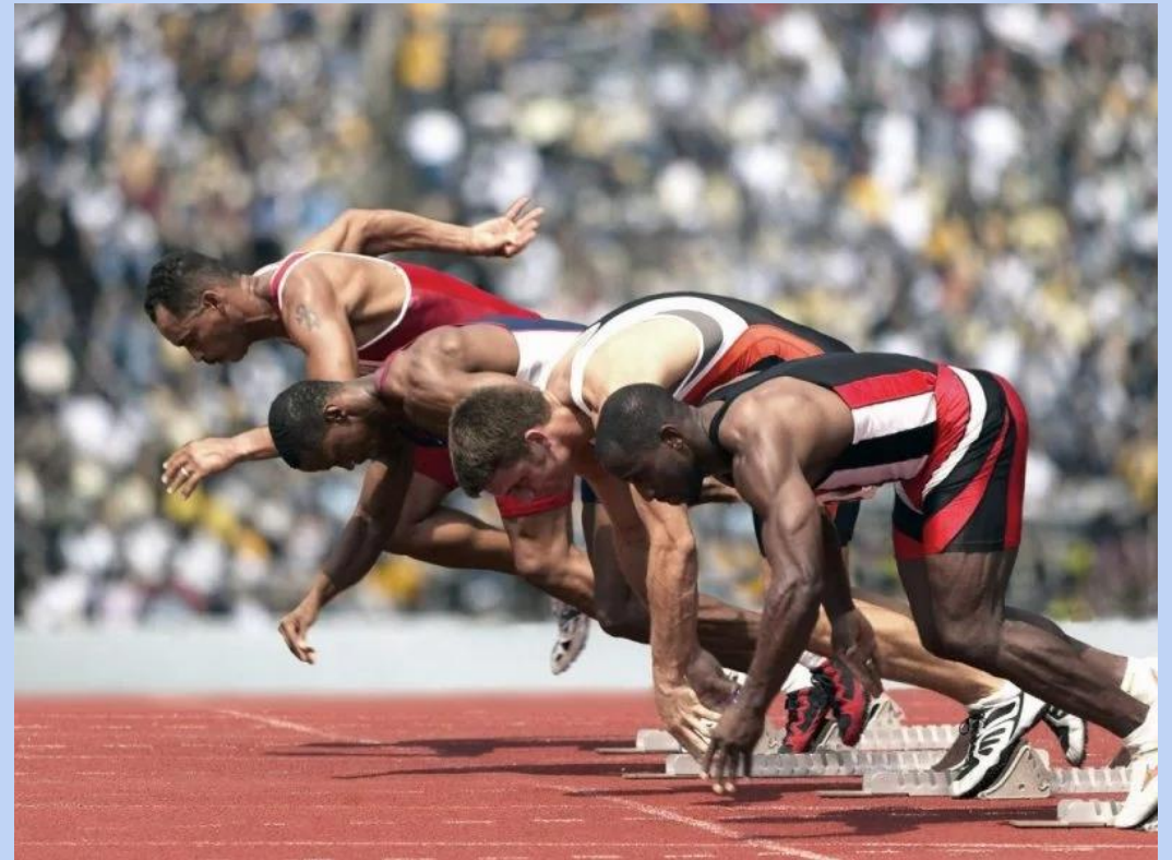
Image 1. How Sprinting Helps you Improve your Health?