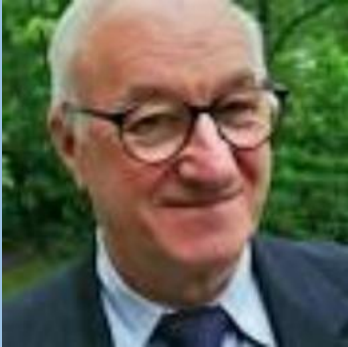
Image 1. Stanford psychology professor Albert Bandura has died.