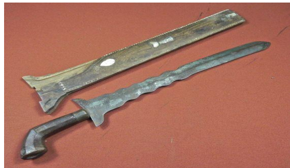
Fig. 8: Kris