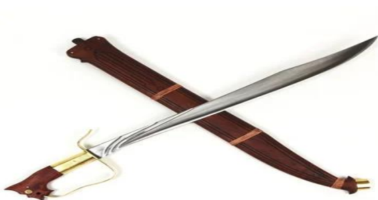
Fig. 9: Sword