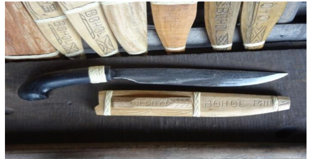
Fig.12: Sundang (Bolo)