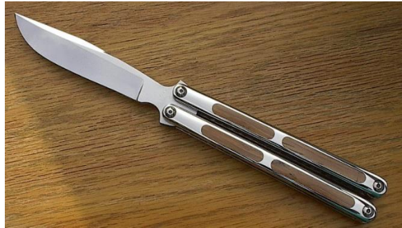
Fig. 6: Balisong