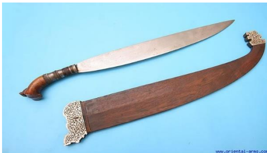
Fig. 13: Barong