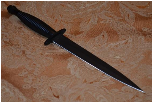
Fig. 5: Single Dagger

There are also bladed weapons that are used in Arnis.