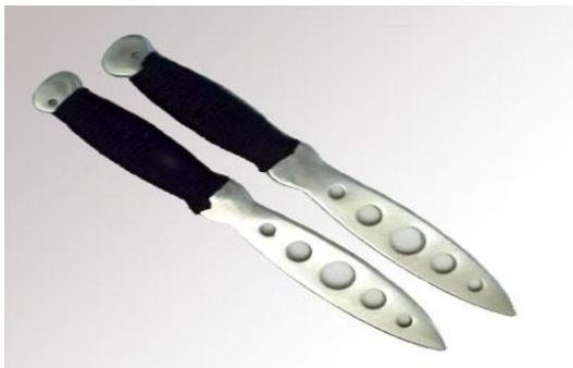
Fig. 7: Double Dagger