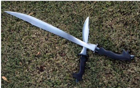
Fig. 11: Sword Dagger