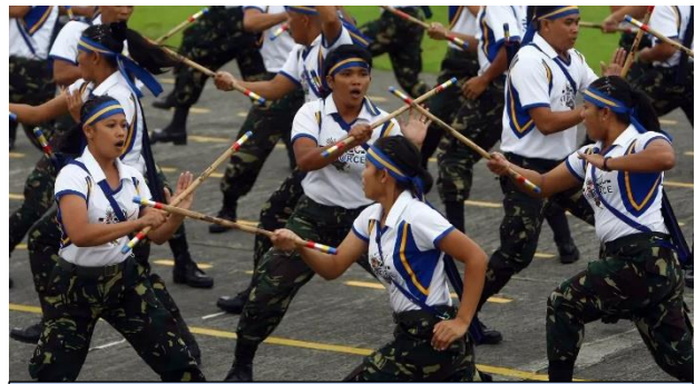
Figure 1: Arnis: The Philippines' National Sport and Martial Arts.

Arnis is a Martial Arts that is developed by a Filipino and was considered the Philippines' National Sports. This sport is somewhat likened to Fencing as a sport in its nature because of its offensive and defensive strokes. This session will present the nature and development of Arnis that is rooted from the history of the Philippines.