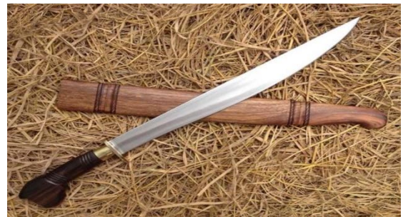
Fig. 14: Pinuti